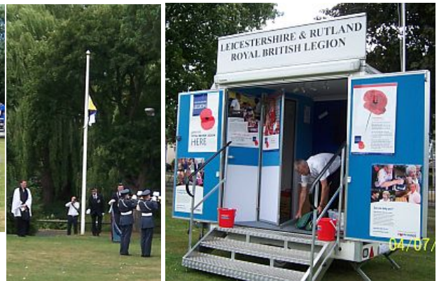
Display stands included the County Recruiting Trailer.