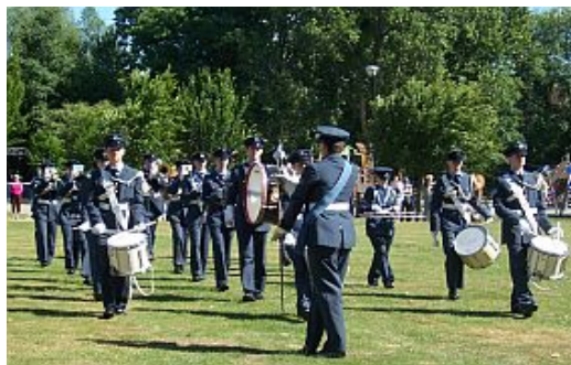
ATC 1084 Squadron Band displayed their marching skill during the event. They also led a parade including the ACF Cadets for the Sunset ceremony which formed the event's finale.