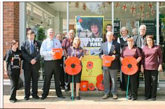
Sainsbury choose the Poppy Appeal as their Charity