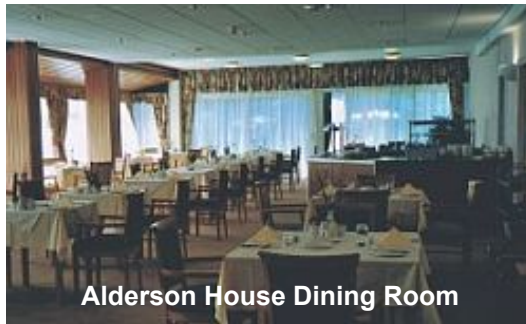
Alderson House Dining Room