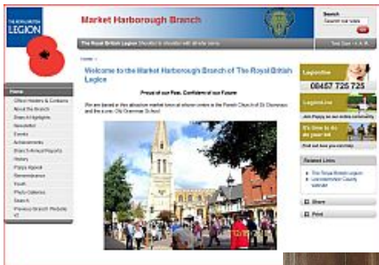
New Branch web-site launched