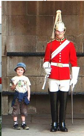
Christopher, Branch mascot, was in the party visiting the Guards Museum.