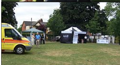
Armed Forces Day event stands - RNA, Police, RAFA, St John, Branch